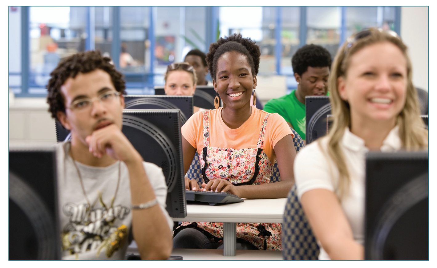
The University of Central Florida has ten regional campuses across central Florida to give students flexibility in finishing their bachelor's or graduate degrees. Here, students sit in class at UCF Ocala.

In 2011, Arizona State officials tested a new adaptive learning technology in an effort to personalize the learning experience and improve student success. The system, created by the start-up company Knewton, builds profiles of each student as they progress through lessons on a computer screen and delivers the next question based on their previous answers or recommends video tutorials when they get stuck on a problem. Students still attend classes scheduled at a fixed time, but instead of being lectured they work alone at a computer and at their own pace, as an instructor roams the room with a class roster that shows which students are on-track (in green) or off-track (in red).