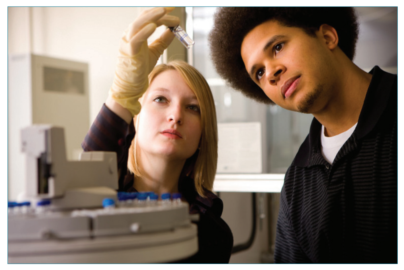
Students perform experiments in the Pharmacology laboratory at University at Buffalo. The "Finish in 4" program guarantees graduation for students who agree to keep their grades up and meet regularly with advisers.

people of the state gave us this land to educate them. We are committed to serving our population in the community and providing support to students."<sup>37</sup>